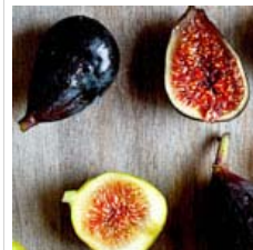
Italy to Brooklyn, Fig by Fig

Home | World | U.S. | N.Y./Region | Business | Technology | Science | Health | Sports | Opinion | Arts | Style | Travel | Jobs | Real Estate | Autos | Site Map