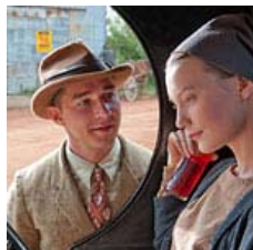
'Lawless,' With Shia LaBeouf