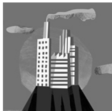
Letter: Invitation to a Dialogue