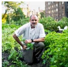
From Top to Bottom, the Feel of a Farm